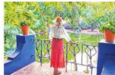
Oasis: Majorelle Gardens offer peace and calm in the city

In Marrakech, October 17 sees the reopening of Amanjena ( aman.com/resorts/amanjena ) after a three-month enhancement project of the public areas and the addition of a new two-bedroom Maison Jardin.