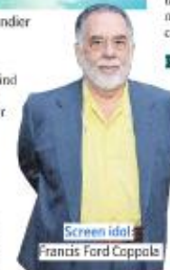
Screen idol: Francis Ford Coppola

Cool off MARRAKECH is rich with the kind of hotels most people could never dream of staying in but many offer day passes to their glorious gardens and pools. La Mamounia ( mamounia.com ), one of the world's most glamorous retreats, allows non-guests into its majestic manicured grounds and pool for the price of a cab ride in London. Less than ten miles away is the