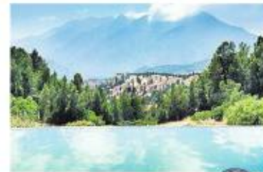
Views: The infinity pool at L'Amandier

It is the highlights of Marrakech's social calendar, with Hollywood descending on the Red City's Djemaa el-Fna square for a regal extravaganza hosted by King Mohammed VI. 'The kingdom of Morocco is among my most favourite places on Earth,' says Coppola. 'So the Marrakech International Film Festival is a joy to amend. My paternal grandmother was born in North Africa [Tunisia] and I remember well the stories she told.' Coppola follows in the footsteps of Martin Scorsese, president in 2013.