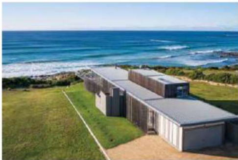
The Ocean Retreat, Tasmania, Australia

Around the world, many other homes with compelling views can be found on the market. When it comes to having the ultimate sea-view few properties can rival The Ocean Retreat, a four-bedroom detached house in Tasmania,