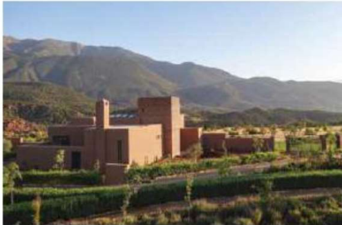
L'Amandier, Marrakech, Morocco