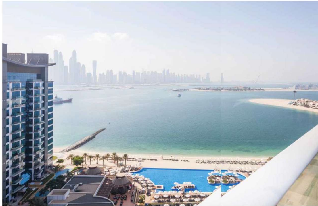
Oceana Residence, Oceana Atlantis, Dubai