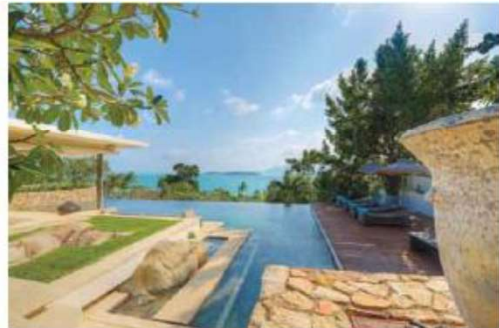
Samujana, Koh Samui, Thailand