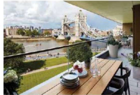
One Tower Bridge, London, UK