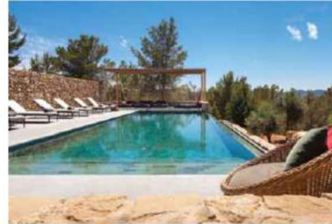
Can Benirras, Ibiza, Spain

The wisdom behind the old property mantra of 'location, location, location' is never truer than when view becomes part of the equation. ■