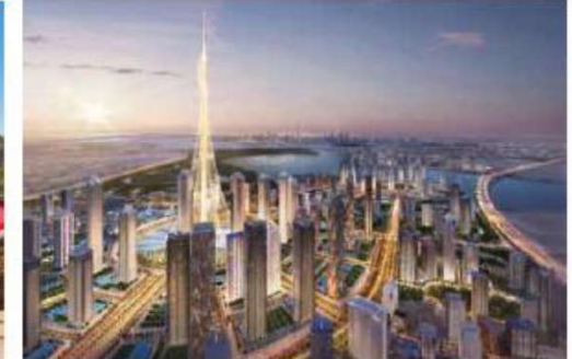
Creekside 18, Dubai Creek Harbour, Dubai